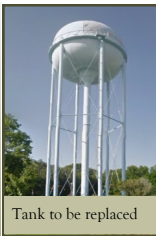
Tank to be replaced

On April 7, 2016, City Council awarded a bid to Landmark Structures I, L.P. for the construction of a 500,000 gallon elevated water storage tank. The new water storage tank will replace the existing tank currently located on Dyche Lane. After completion, this will add an additional 500,000 gallon capacity of emergency water, boosting fire flow protection in the area nearest the tank. At this time, fire flow protection meets or exceeds state requirements in the area but was identified in the recent Utility Master Plan for added pressure. The tank will be a composite tank similar to the one on the north side of town along Bypass 35. The projected start of the project is June of this year with a completion target of 18 months.